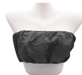
Disposable Non-Woven Spa Underwear Set | OEM Whole...