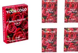
4 in 1 Deluxe Vegan Pedicure Kit in Box Spa Profes...