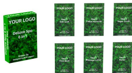
Green Tea Vegan Deluxe Spa 6-in-1 Pedicure Kit Sal...