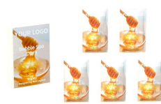
Honey Bubble Spa 5 in 1, Crystal, Activator, Sugar...