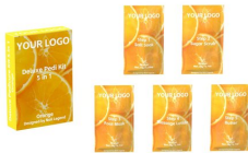
Professional Spa Deluxe Pedicure Kit 5 1 Herbal Or...