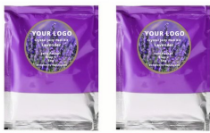
Lavender Custom Scented Jelly Salt Pedicure Powder...

Live category page: deluxe-spa-kit · 81 SKUs live.