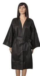
Disposable Non-Woven Kimono Bathrobe (10 pcs/bag) ...