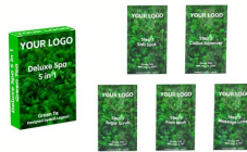
Professional Deluxe Spa 5 1 Kit Organic Herbal Veg...