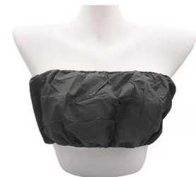
Disposable Non-Woven Spa Underwear Set | OEM Whole...