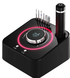
UV-601 Nail Drill with 40000rpm Rechargeable Brush...

Live category page: salon-equipment · 56 SKUs live.