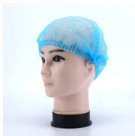
Disposable Non-Woven Bouffant Cap | OEM Wholesale ...