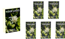
Jasmine Jelly Spa 5-in-1 Organic Vegan Pedicure Ki...