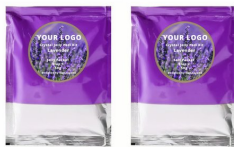
Lavender Custom Scented Jelly Salt Pedicure Powder...

Live category page: deluxe-spa-kit · 81 SKUs live.