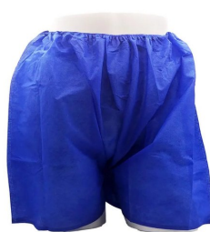
Disposable Men's Non-Woven Boxer Briefs | OEM Whol...