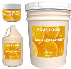
Vegan Pedicure & Nail Salon Spa Massage Lotion...