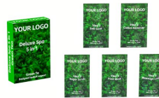
Professional Deluxe Spa 5 1 Kit Organic Herbal Veg...