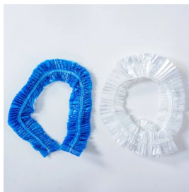
Hygienic Pedicure Spa Liner Clear Blue Strip Design...

Live category page: nail-accessories · 134 SKUs live.