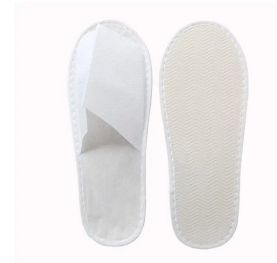
Disposable Non-Woven Spa Slippers | OEM Wholesale ...