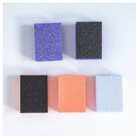
Professional Mini Nail Buffer Disposable EVA Recta...