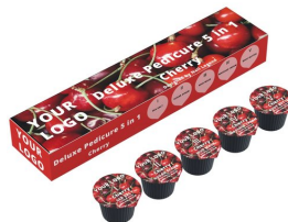
5 1 Deluxe Vegan Pedicure Kit Salt Soak Sugar Scru...