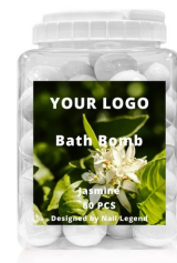
Private Label Jasmine Flavor Bath Fizzies 60 Pcs./...