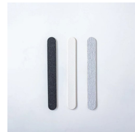
Mini Wooden Nail File for Manicure and Pedicure 80...