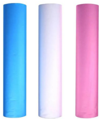
Disposable Waterproof Massage Sheet Roll | OEM Who...

Live category page: non-woven-products · 20 SKUs live.