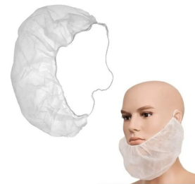
Disposable Non-Woven Beard Cover Net | OEM Wholesa...