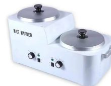
Professional Hot Wax Heater with Temperature Contr...