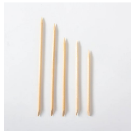
Orange Wooden Cuticle Stick Nail Pusher Double-Sid...