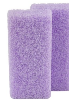
Disposable Pedicure Pumice Stones Medium/Coarse Gr...