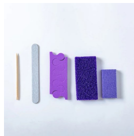
5 in 1 Customized Salon Pedicure Kit 200 Set/carto...