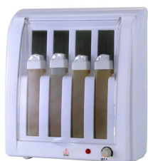
4-in-1 Cartridge Wax Heater — 100g x 4, Mechanical...