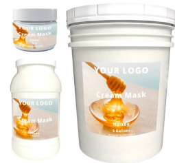
Private Label Salon Pedicure Foot Cream Mud Mask M...