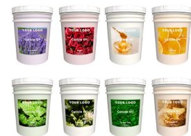
Cuticle Oil Private Label | Wholesale OEM Manufact...