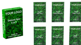
Green Tea Vegan Deluxe Spa 6-in-1 Pedicure Kit Sal...