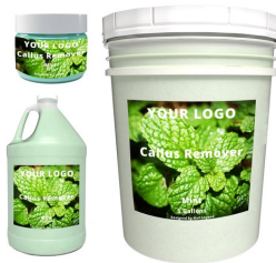
Private Label Mint Flavo Gel for Foot Callus Remov...