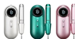
Custom Logo 30pcs Nail Drill Pedicure Machine with...