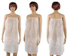
Disposable Non-Woven Salon Bathrobe | OEM Wholesal...