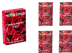
4 in 1 Deluxe Vegan Pedicure Kit in Box Spa Profes...