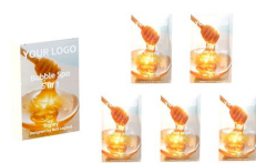
Honey Bubble Spa 5 in 1, Crystal, Activator, Sugar...