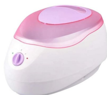
Electronic Thermostat Salon Equipment Plastic Spa ...