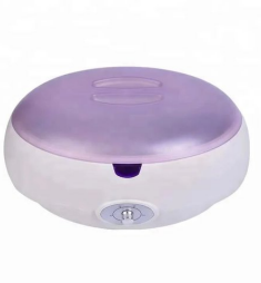
Professional 3200ml Pink Paraffin Wax Machine for ...