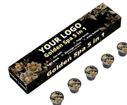
Golden Spa Professional 5-in-1 Pedicure Kit | Priv...