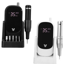
High Power 85W Professional Nail Drill Machine 350...