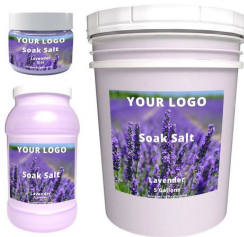
Private Label Lavender Flavor Dead Sea Salt Soak S...

Live category page: personal-care · 191 SKUs live.