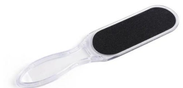
Disposable Plastic Foot Rasp Double-Side Replaceab...