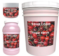
Sugar Scrub Private Label Cherry Flavor Chemical E...