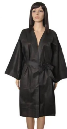
Disposable Non-Woven Kimono Bathrobe (10 pcs/bag) ...