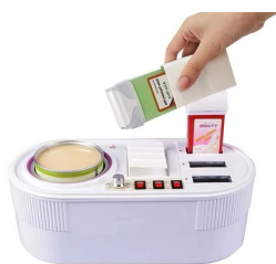
3-in-1 Multi-Function Wax Warmer — 800ml + 500ml +...