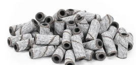
Professional 100Pcs/Box Small Sanding Band for Ele...