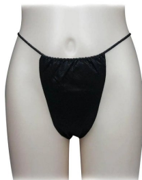
Disposable Non-Woven Thongs for Spa Waxing | OEM W...