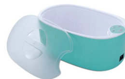
Large 5L Capacity Paraffin Wax Bath 5000ml Electro...