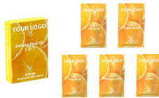
Professional Spa Deluxe Pedicure Kit 5 1 Herbal Or...