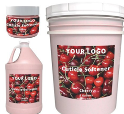
Cuticle Softener Private Label Cherry Flavor, Mult...